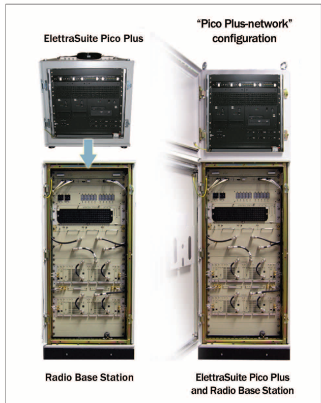
Pico Plus on BST2 top mounted, "ElettraSuite Pico Plus-network" configuration.