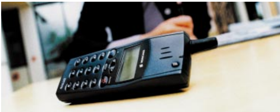
6. Get the message even when your extension is diverted

4. Somewhere on your premises, a burglar alarm goes off. Not only does our software alert the police, it also sends additional information to your security personnel. Keeps your assets safe.