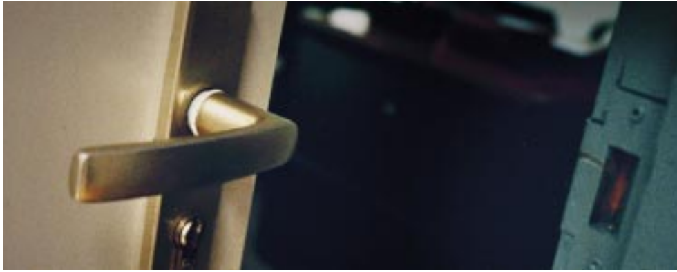
4. Identify security breaches in time