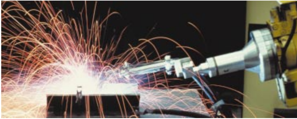
1. Avoid costly downtime