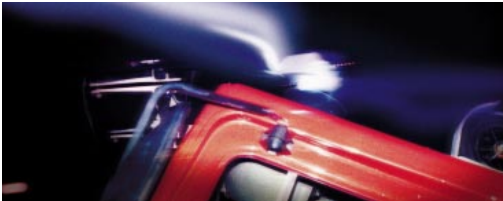
5. Locate the source of a fire immediately