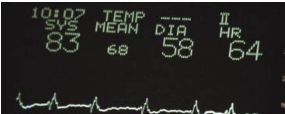
2. Fast response in life-or-death situations

1. One of the robots in a manufacturing plant develops a fault. Thanks to Ericsson's Contact Message Package, the machine itself instantly sends a message to an engineer who is available to fix the fault. It tells him where to go and the nature of the problem so that he arrives with the right equipment. A separate message goes to the head of operations to help him work around the problem until it is sorted out. Saves time, saves money.