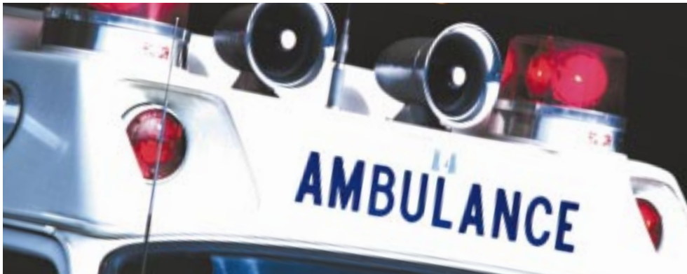
2. Get medical help sooner