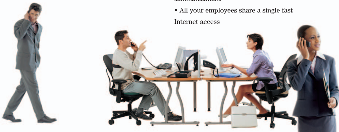
VOICE+INTERNET+DATA All-in-one box